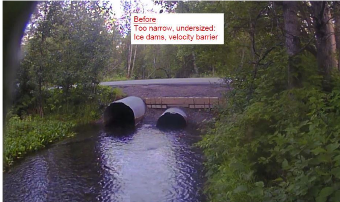
Cottonwood Creek culverts – before.

Project Description: Fish passage has been a long-term focus for restoration activities in the Mat-Su Borough for over 15 years. Alaska Department of Fish and Game (ADFG) has assessed 567 crossings on fishbearing streams with about 70% of them some type of barrier to fish movement.