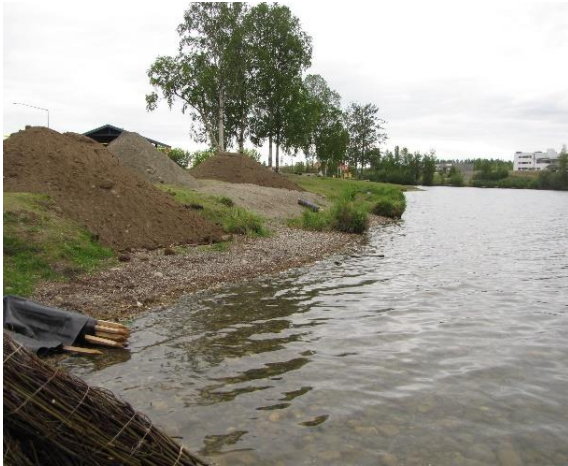
Figure 1. Site Conditions Prior to 2010 project, looking west towards the parking lot.