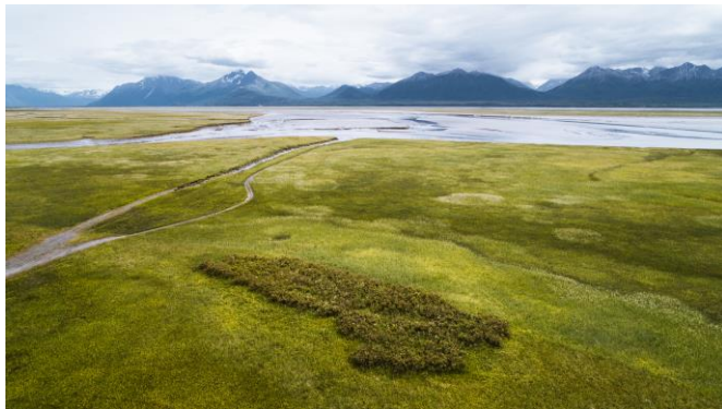
Cottonwood Creek outlet in Knik Arm

GLT's focus is on land conservation for community benefit – we work to protect wetlands that provide clean drinking water, intact healthy habitats for salmon and wildlife, miles of coastline for fishing and outdoor classrooms, to establish public access to the outdoors and open space, and to help bring awareness to local residents on ways they can contribute to conservation.