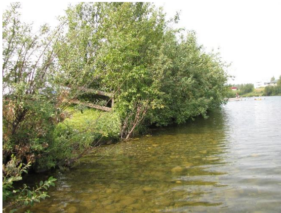
Figure 2. Project site in July of 2019, looking west towards the parking lot.

Project Description: Wasilla Lake is one of the nine lakes that Cottonwood Creek flows through and includes Newcomb Park - a popular area for swimming during the summertime. The City of Wasilla, Mat-Su Borough, Envision Mat-Su, USFWS, and ADF&G all worked together to complete revegetation at this location in 2010 and 2012. In 2010, 60' of brush layers and 40' of trenched willows were completed, along with a split rail fence. In 2012, partners completed 110' of trenched willows and 40' of live staking.