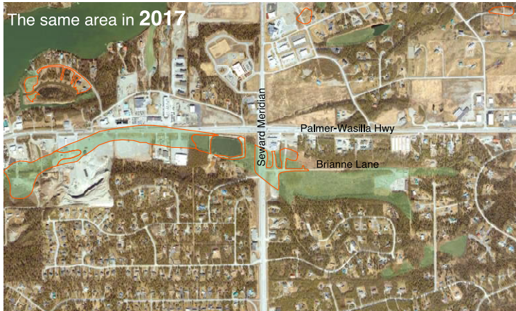
The same area in 2017

example, must be replaced by something more costly. Numerous studies in small urbanized watersheds find that where hardened surfaces exceed anywhere from about 2-15% of the land, sharp declines in stream quality can be expected. 1