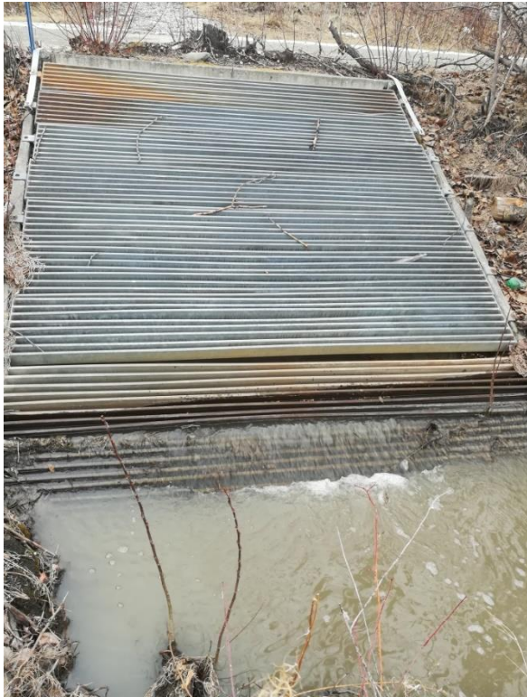
Polluted stormwater runoff being discharged directly to Lake Lucille in Wasilla.