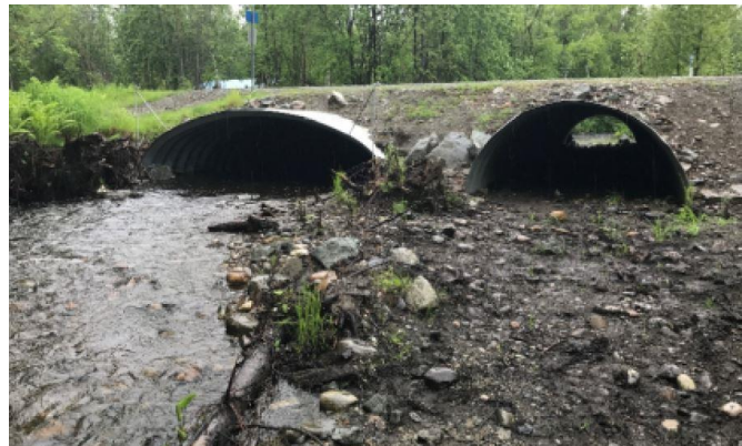
Cottonwood Creek culverts – after.

Riverdell Drive fish passage project is one of over a hundred fish passage projects carried out to date in the Mat-Su Borough. This original crossing was fairly typical of residential road development in the area, when the road was built several smaller culverts were placed into a large stream. Over time that type of structure causes a partial blockage of fish movement, erosion of the banks and bed of the stream and icing and flooding issues on the roads. Replacing the undersized culverts with a single large culvert and a constructed stream channel designed to mimic the natural channel allows for the free movement of flood flows, sediment, fish and other aquatic organisms. It also reduces or prevents ice damming in the winter. At Riverdell, due to the channel type, a second flood plain relief culvert was also installed that allows for animal passage.