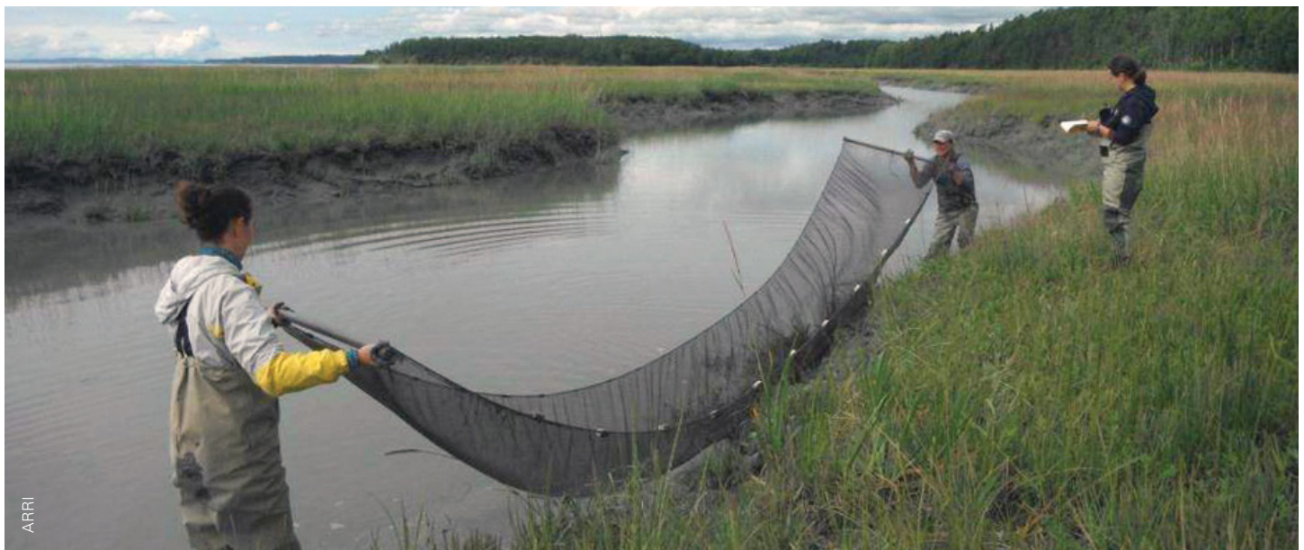
Below: Researchers with the Aquatic Research and Restoration Institute (ARRI) sample O'Brien Creek near its outlet as part of a greater effort to learn more about juvenile salmon use of Knik Arm estuaries.

150 miles Partners surveyed and added over 150 miles of stream to the Anadromous Waters Catalog. This catalog is an Alaska Department of Fish and Game (ADF&G) data set that tracks salmon distribution. Once a stream is officially listed in the catalog, specific protections are afforded under state law.