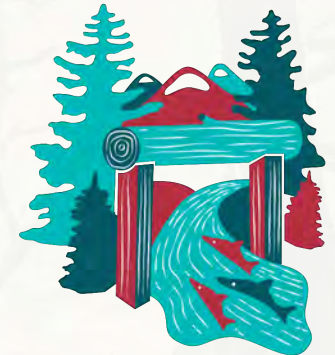
Community Fisheries & Forestry