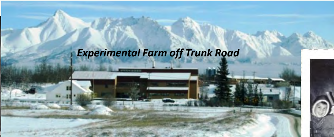
Experimental Farm off Trunk Road