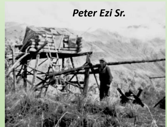
Jim Creek & Swan Lake